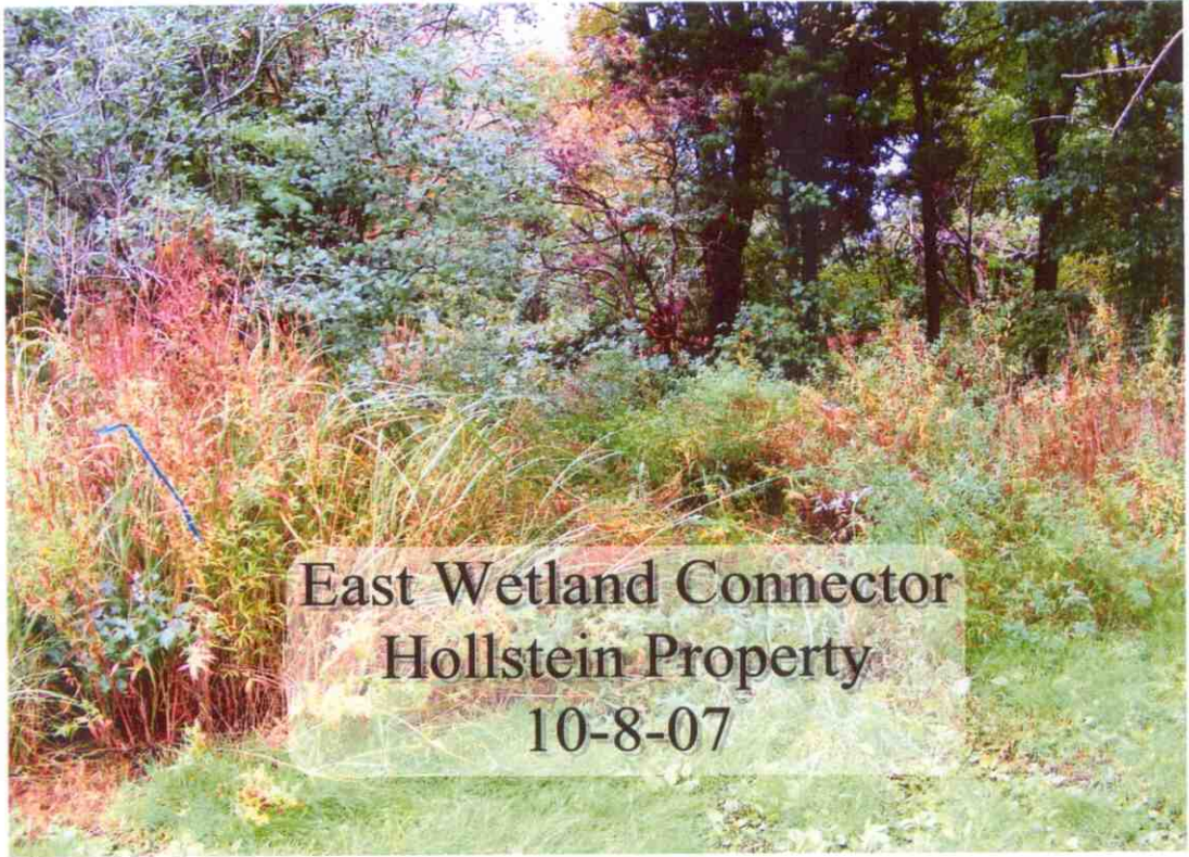
East Wetland Connector Hollstein Property 10-8-07